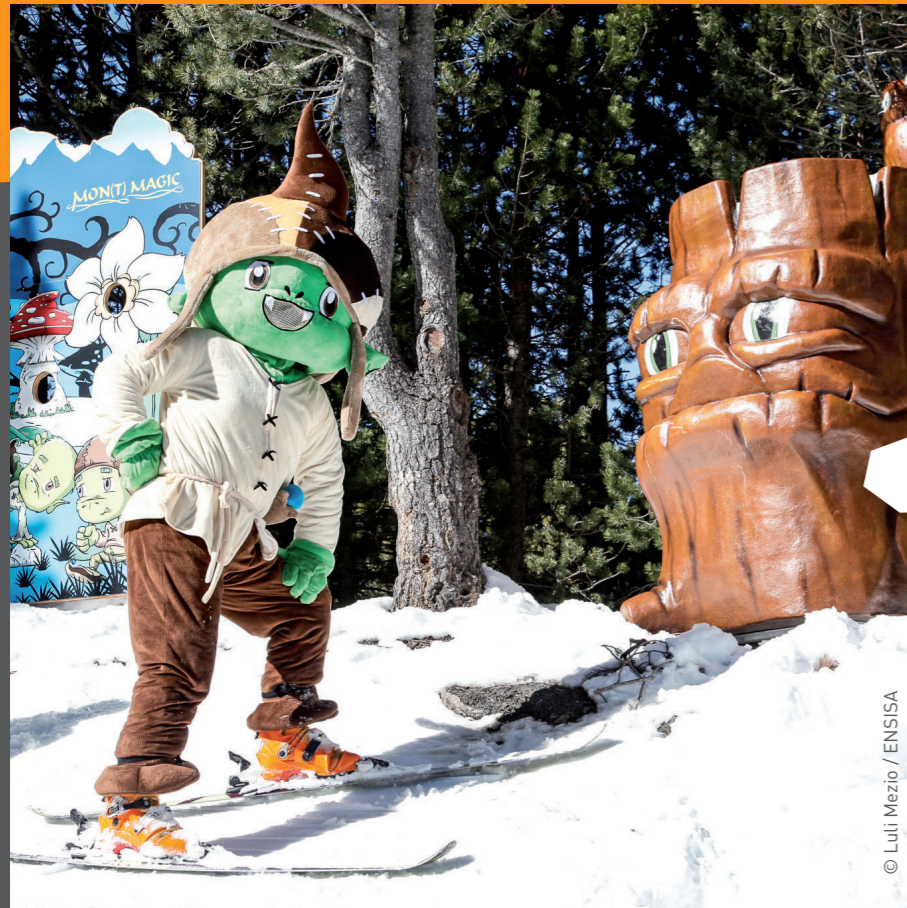
Mon(t) Magic in Grandvalira/AND

Of course, we're also happy to tell your own individual story and can stage-set the really special theme of your region! Here you can see projects that have already been realised: