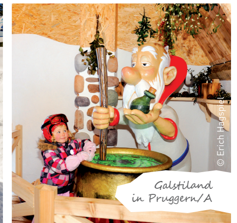
Galstiland in Pruggern/A