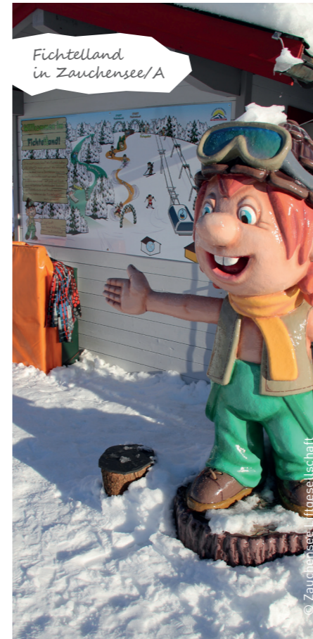
Fichtelland in Zauchensee/A