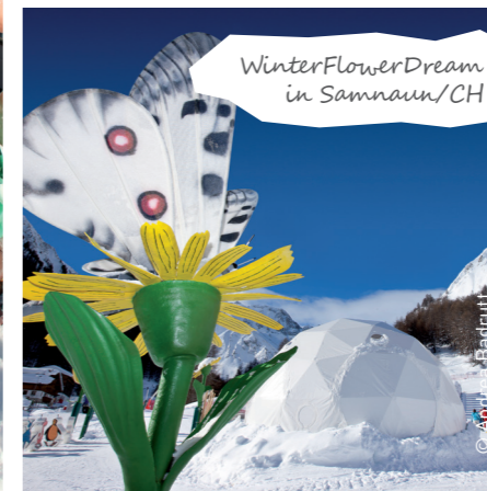
WinterFlowerDream in Samnaun/CH