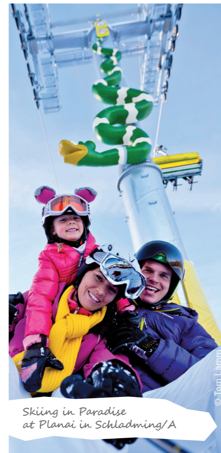
Skiing in Paradise at Planai in Schladming/A