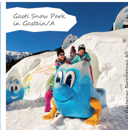
Gasti Snow Park in Gastein/A