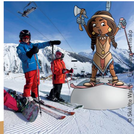
© Skilifte Waid - Ferienpark Seefeld