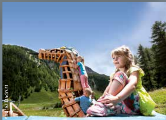
Samnaun fairytale route Samnaun, Graubünden (SUI) Municipality of Samnaun

We look after our domestic and international customers – from planning to the opening. These include cableways, tourism associations, national parks, nature reserves and companies.