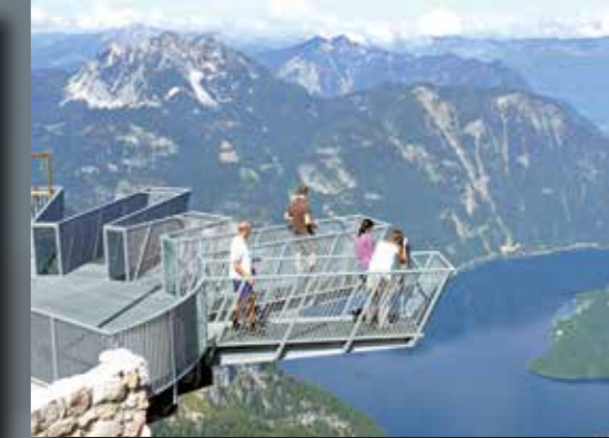
"5fingers" viewing platform Dachstein-Krippenstein, Upper Austria (AUT)

We look after our domestic and international customers – from planning to the opening. These include cableways, tourism associations, national parks, nature reserves and companies.