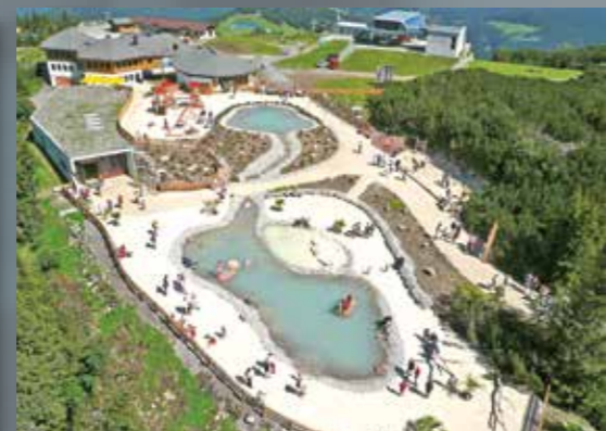
Triassic Park Steinplatte/Waidring, Tyrol (AUT) Steinplatte Aufschließungsgesellschaft