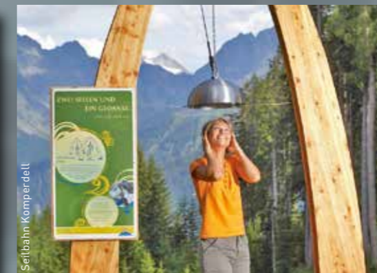
Six Senses – sensory adventure trail Serfaus, Tyrol (AUT) Tourism Association and Mountain Railway Serfaus-Fiss-Ladis