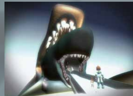
Preliminary concepts for King Abdullah Tourist City Jeddah (KSA) Royal dynasty of Saudi Arabia