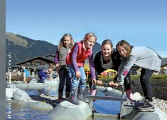
Mooraculum Sörenberg, Lucerne (CH) Bergbahnen Sörenberg