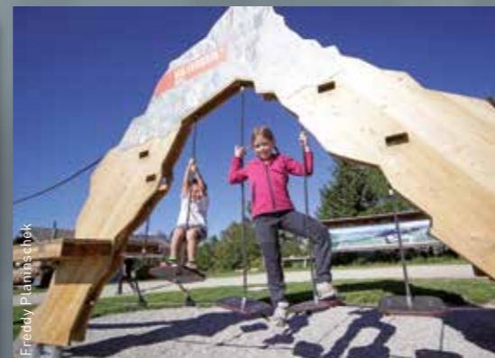
Active Camp Alta Badia, South Tyrol (ITA) Skicarosello Corvara