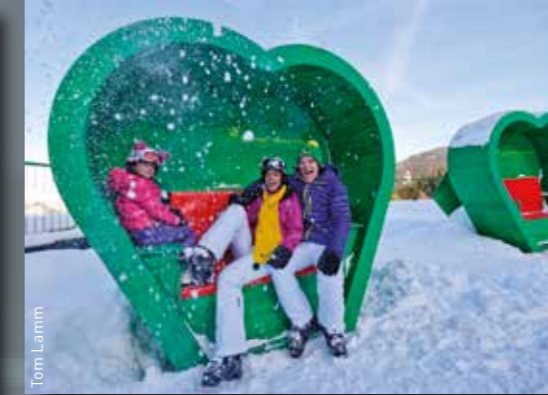
Skiing in Paradise Schladming, Styria (AUT) Planai-Hochwurzen-Bahnen