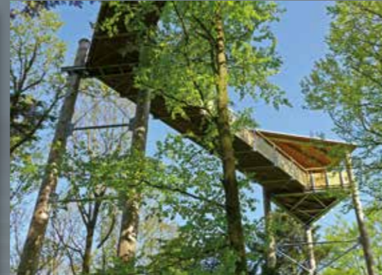
Baumkronenweg Trail Waldkirch, Baden-Wuerttemberg (GER) Baumkronenweg Waldkirch GmbH