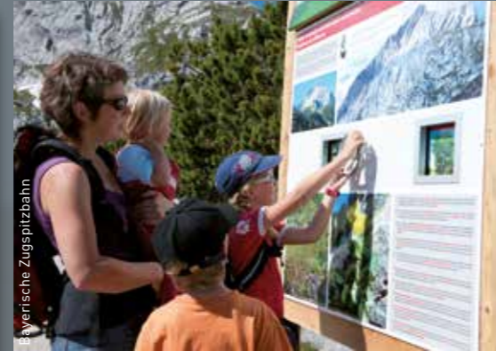
Summit Adventure Trail, Garmisch-Classic Garmisch-Partenkirchen, Bavaria (GER) Bayerische Zugspitzbahn