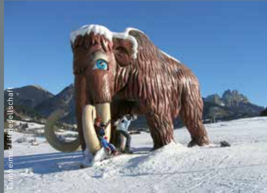
"Ice Age" winterland for children Tannheim, Tyrol (AUT)